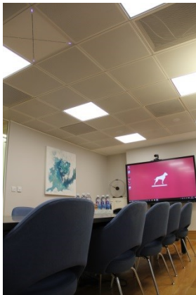
TeamConnect Ceiling has been customized to match the actual room conditions.

can start. The suppression of background noise delivered by the Sennheiser product works very well. The noise of the air conditioning, for example, can't be heard by external participants. Dave Nish's round-up: "If we weren't happy, we'd simply return the product. But it is still here."