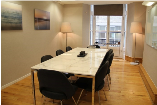
TeamConnect Wireless works cable-free.